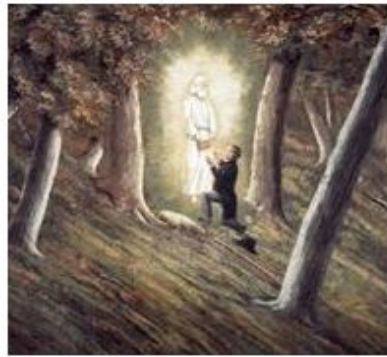
Joseph Smith, Jr.