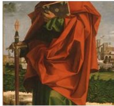
Paul the Apostle