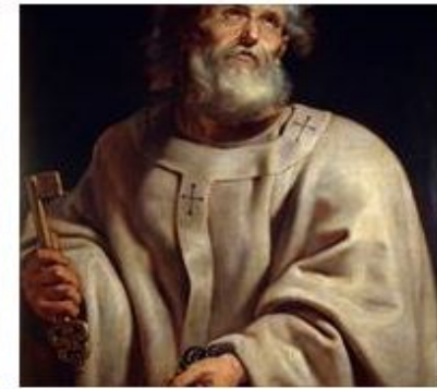
Saint Peter the Apostle