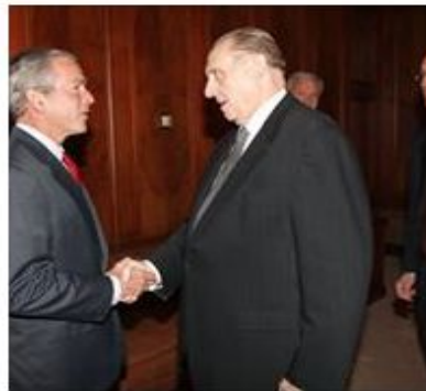
Thomas S. Monson