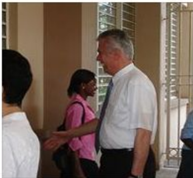
Dieter F. Uchtdorf