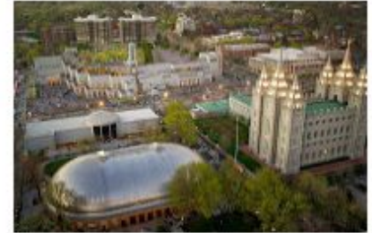
Beautiful 'Temple Square' in downtown SLC, Utah

How do you encapsulate 10 hours of General Conference - including speakers, music and prayers into readable segments? I'll do my best to share some of my favorite one-liners that touched my soul. I hope that these will be enough to inspire a further reading of the full-texts of these talks for those who were unable to attend and a more in-depth-study for those who did.